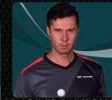
VLADIMIR SAMSONOV BELARUS