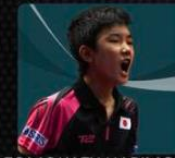
TOMOKAZU HARIMOTO JAPAN